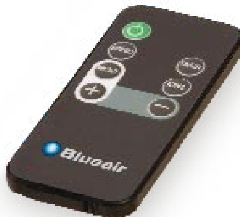
A little device with a lot of finesse. The Blueair E Series wireless remote control puts air-purifying convenience at your fingertips.

On/off timer. Don't want to run your unit 24/7? Then press the timer button to set the start or end time for operation. Simply click on the + and – keys to adjust the time by half-hour intervals.