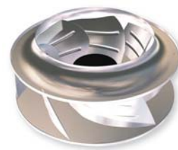
high-performance electronically commutated fan motor